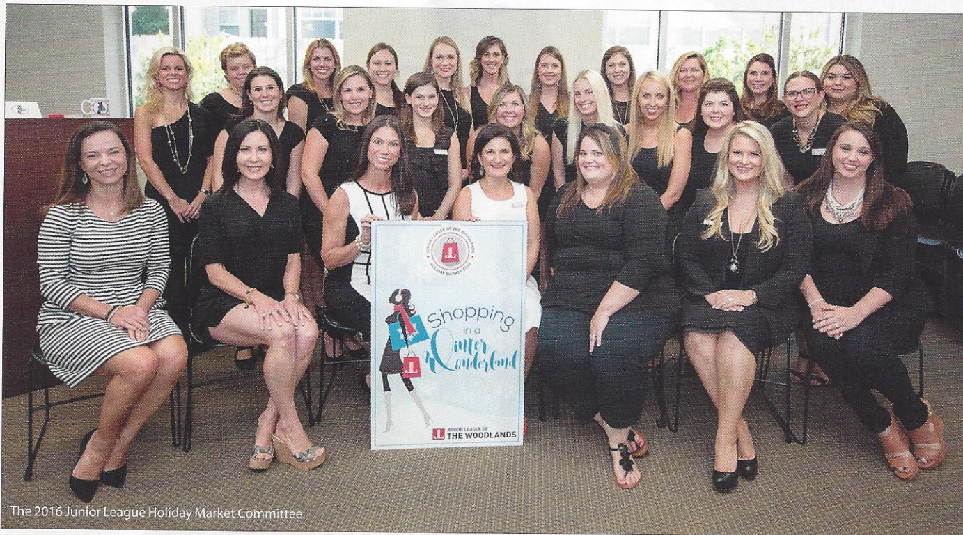
The 2016 Junior League Holiday Market Committee.